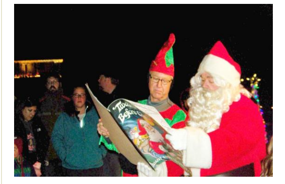
"T'was the Night Before Christmas" reading by Santa and his Elf