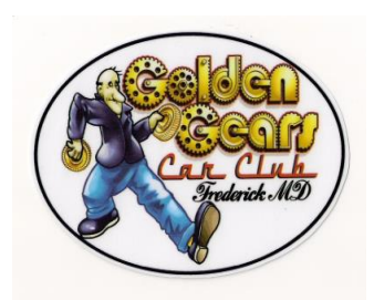
We're on the Web! www.goldengears.org